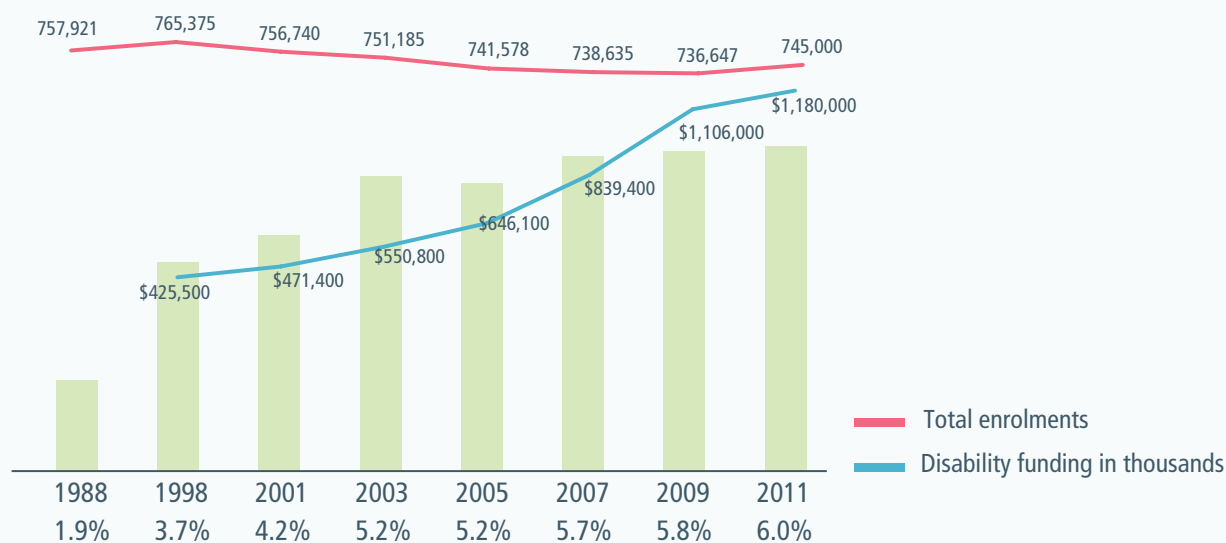
Annual enrolment of students with confirmed disability – showing percentage of total enrolments

Students, or their parents, must be consulted about the adjustments that are put in place for the student.