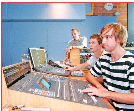
Students at TAFE studying for their future career. Find out more at www.tafensw.edu.au

The brochure has been developed through an initiative known as the School to Work Program . This Program provides students with a range of experiences that build their skills and confidence to plan a successful transition from school. Students use the Employment Related Skills Logbook (often referred to as 'the blue book') to identify and record their work/life skills as a result of their participation in classroom, community